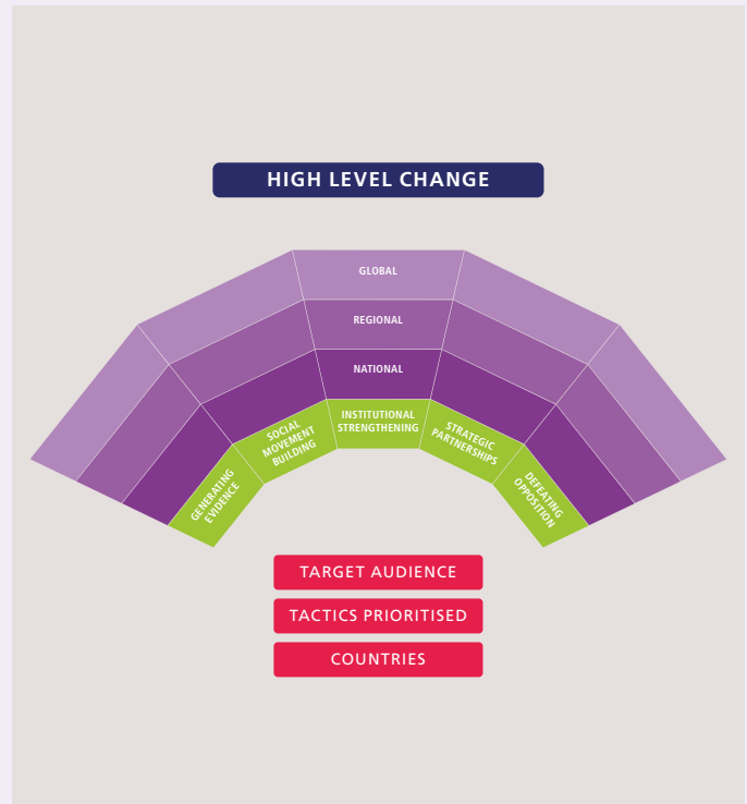
Diagram 5: High level change