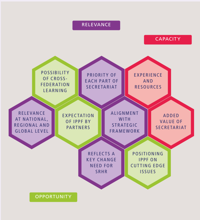
Diagram 4: Prioritisation criteria in the Advocacy Common Agenda